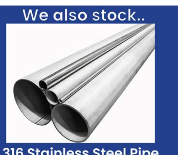
316 Stainless Steel Pipe

Our Threaded Fittings are produced through the castings process and can be supplied in material 316 with threads according to NPT and BSP.